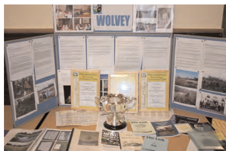
Display and prizes for the Wolvey Entry